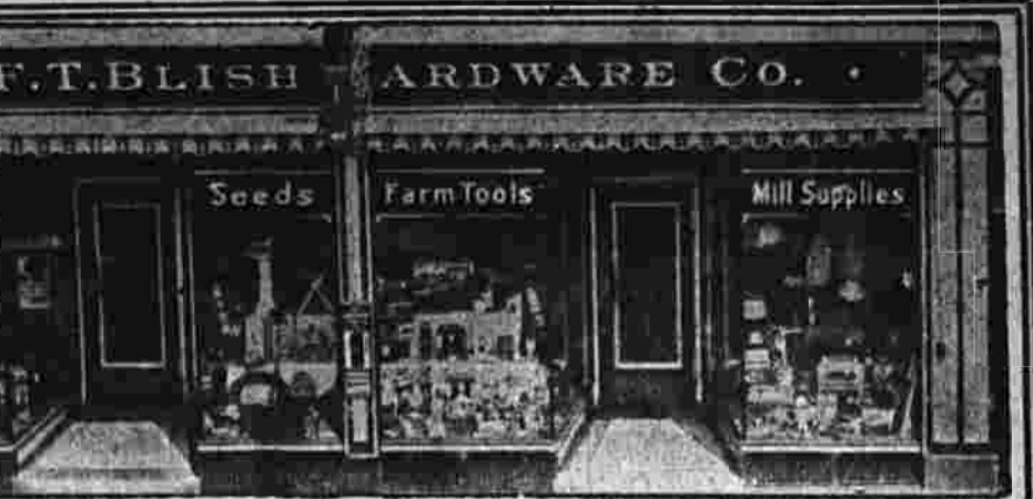
Quantities and Sizes are Important Factors in Our Business Today

30 years ago a Buffalo druggist created an ointment for relief from the itching and smarting of Piles. It brought such quick soothing, astringent relief that its fame spread throughout the country.